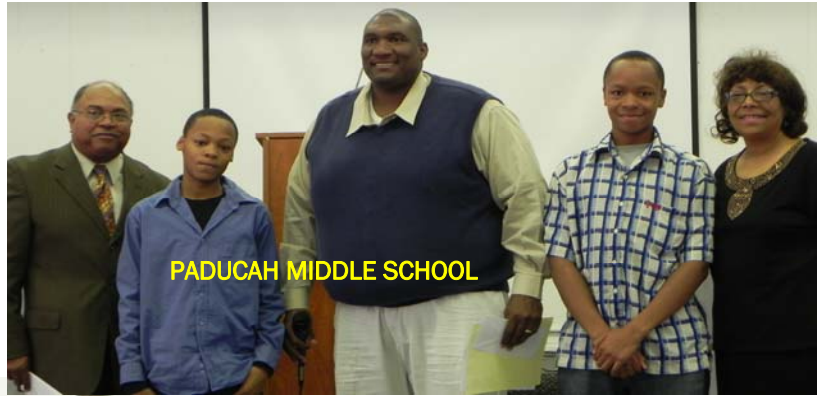
PADUCAH MIDDLE SCHOOL