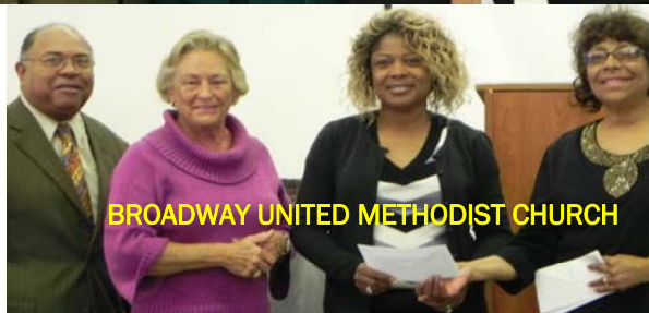
BROADWAY UNITED METHODIST CHURCH