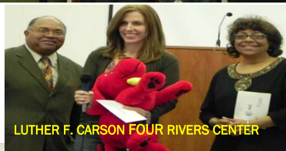
LUTHER F. CARSON FOUR RIVERS CENTER