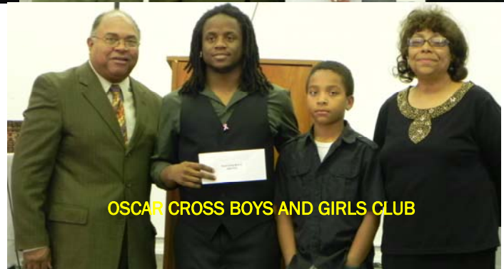
OSCAR CROSS BOYS AND GIRLS CLUB