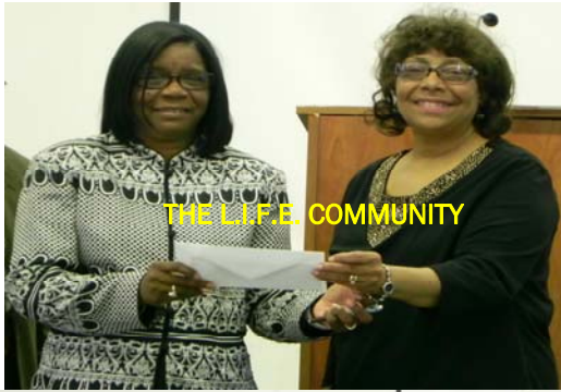
THE LIFE COMMUNITY