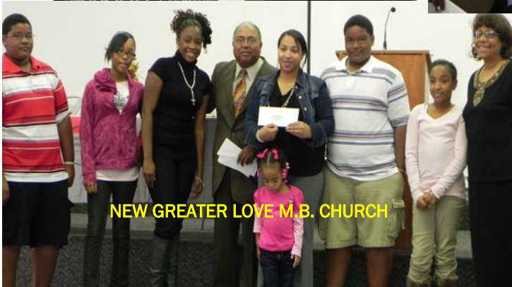
NEW GREATER LOVE M.B. CHURCH