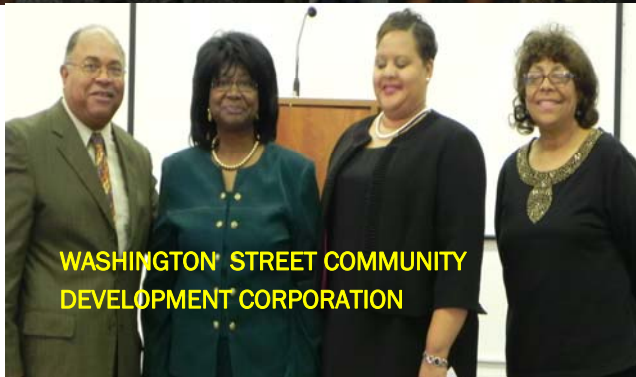
WASHINGTON STREET COMMUNITY DEVELOPMENT CORPORATION