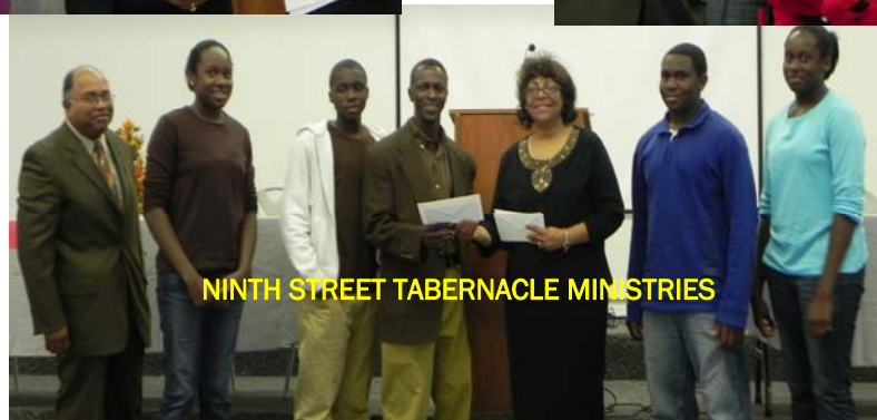
NINTH STREET TABERNACLE MINISTRIES